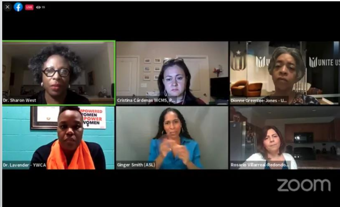
Panelists discuss the experiences of Black, Indigenous and People of Color as they relate to the COVID-19 pandemic during Buncombe County's "Let's Talk COVID-19 The Vaccine" discussion on Facebook Live Jan. 27.