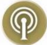
ESF 2 Communications