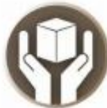
ESF 15 Volunteers and Donations