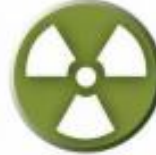
ESF 10 Hazardous Materials