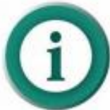
ESF 14 Public Information