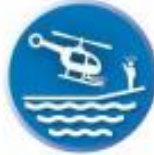
ESF 9 Search and Rescue