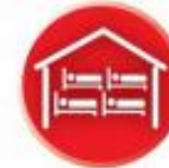
ESF 6 Mass Care