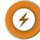
ESF 12 Energy