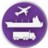
ESF 1 Transportation