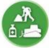
ESF 7 Resource Support