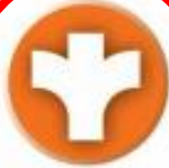
ESF 8 Health and Medical