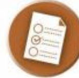
ESF 5 Information and Planning