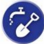
ESF 3 Public Works