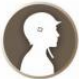
ESF 13 Military Support