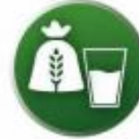
ESF 11 Food and Water