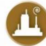
ESF 18 Business and Industry