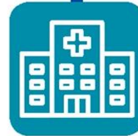
Access to and Linkage with Clinical Care