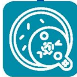
Communicable Disease Control