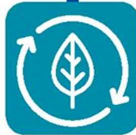
Environmental Public Health