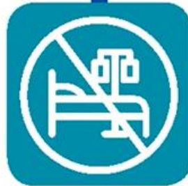
Chronic Disease and Injury Prevention