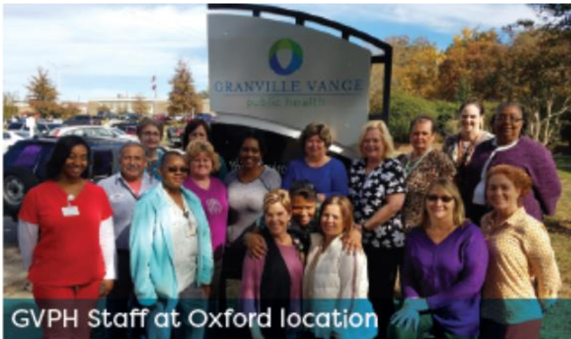
GVPH Staff at Oxford location