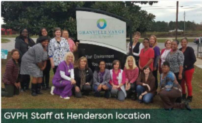
GVPH Staff at Henderson location

Care managers across the state travel to outlying areas of the county, visit patients at other provider offices, deliver care plans, problem solve, and connect patients to wrap-around services and SDOH opportunities when they are available. In many cases, the work of a case manager is similar to the work of a Disease Intervention Specialist (DIS officer) where being wise, kind, brave, trauma-informed, patient, and incredibly persistent are key character traits.